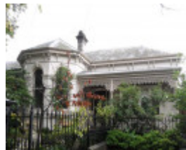
3 and 5 Avondale Road Figure 4 Front facade of 5 Avondale Road. Note casement box bay window beneath verandah. .jpg