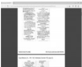
3 and 5 Avondale Road Figure 3 Sale notice, 3 Avondale Road, Armadale, 1903.jpg