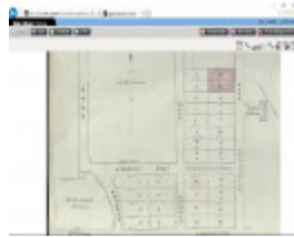
3 and 5 Avondale Road Figure 1 Plan of subdivision of Parts of Crown portions 52 and 51, City of Prahran at Armadale, c.1881, SLV.jpg