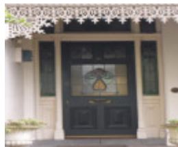
3 and 5 Avondale Road Figure 5 Early twentieth-century door and leadlights at 5 Avondale Road. (source: Context, 2017).jpg