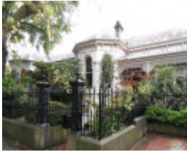
3 (left) and 5 (right) Avondale Road Cover Photo.jpg