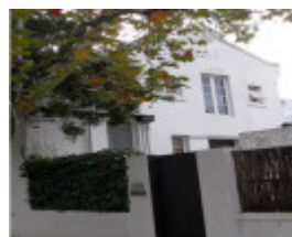
3 Avondale Stables.jpg