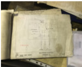
Substation circuit diagram