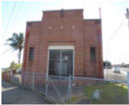
Brunswick West Tramway Substation