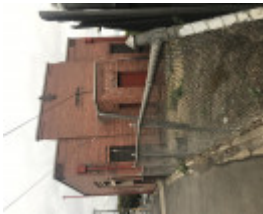
Brunswick West Tramway Substation from rear