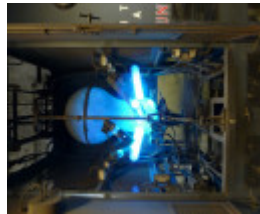
Mercury arc rectifier operating as a number 55 tram approached