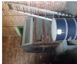
Box for mercury arc rectifier