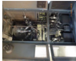
Mercury arc rectifier