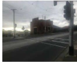
Brunswick West Tramway Substation