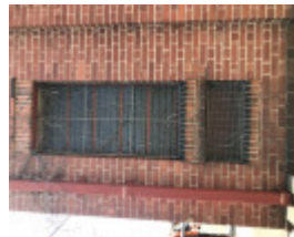
Tapestry brick and window grill