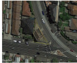
Brunswick West Tramway Substation from above