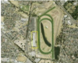
Aerial Photo of Sandown.jpg