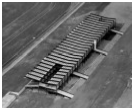
The grandstand (prior to interior fitout) as seen in aerial photograph 1963.jpg