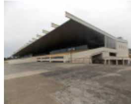
from east (trackside), looking south-west.jpg