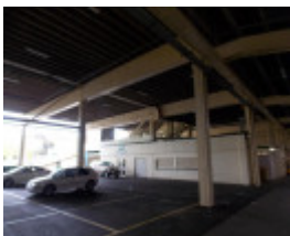
General view of undercroft area showing exposed structure and low-rise infill.jpg