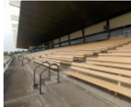
Detail of seating area, showing stepped concrete tier, bench seats and canopy underside.jpg