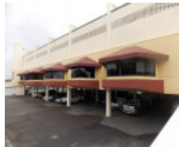
General view of the 1976 additions from west (carpark side), looking north-east.jpg