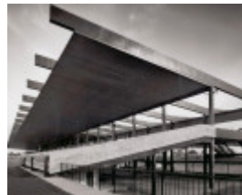
The grandstand 1962.jpg