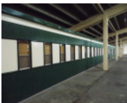
Original tote building in undercroft area north end showing hatch-like windows.jpg