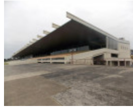
from east (trackside), looking south-west.jpg