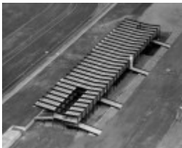
The grandstand (prior to interior fitout) as seen in aerial photograph 1963.jpg