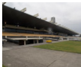
view of the grandstand from east (trackside), looking north-west.jpg