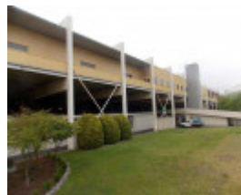
General view of the grandstand from west (carpark side), looking south-east.jpg