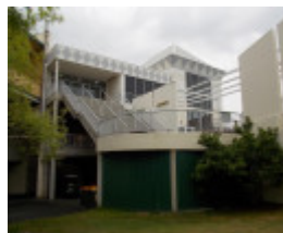
New entry porch on eastern side added in 1994.jpg