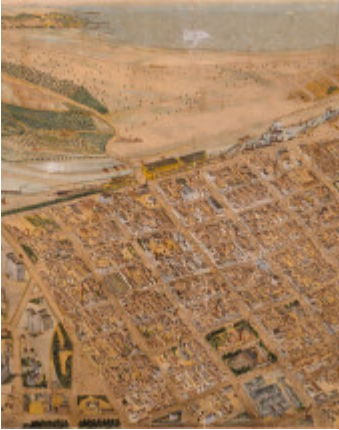
1866 Isometrical Plan of Melbourne