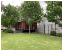
1st Dandenong Scout 2023 8