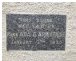
1st Dandenong Scout 2023 12