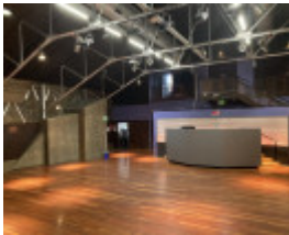
1st Dandenong Scout 2023 6