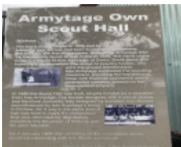
1st Dandenong Scout 2023 11