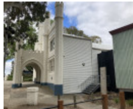
1st Dandenong Scout 2023 7