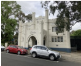
1st Dandenong Scout 2023 1 Front