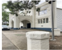
1st Dandenong Scout 2023 3