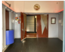
1st Dandenong Scout 2023 5