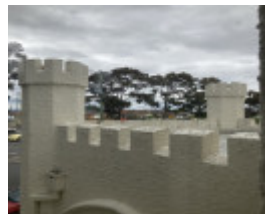
1st Dandenong Scout 2023 10