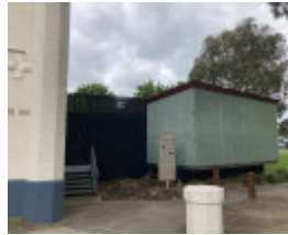
1st Dandenong Scout 2023 4