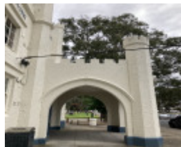
1st Dandenong Scout 2023 9