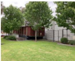
1st Dandenong Scout 2023 8