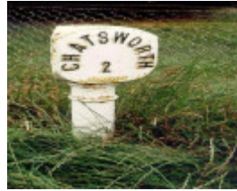
cast iron mile posts caramut 2 miles