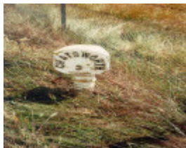
1 cast iron mile posts caramut 3 miles