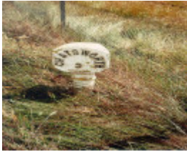
1 cast iron mile posts caramut 3 miles