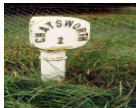
cast iron mile posts caramut 2 miles