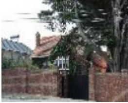
930 Toorak Road, Camberwell