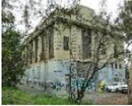
Myrtle Road Warburton Road, 26A & 2B EAST CAMBERWELL SUBSTATION