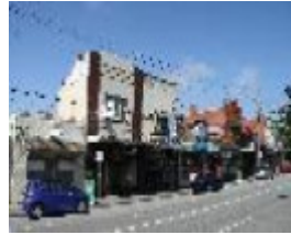
SOUTH CAMBERWELL COMMERCIAL PRECINCT street.jpg