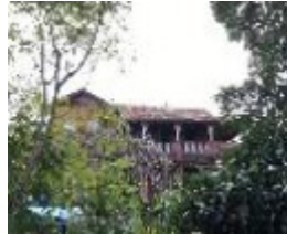
653 Burke Road.jpg