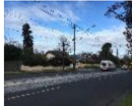
HO144 BURKE ROAD PRECINCT EXTENSION street