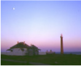
1 gabo island lightstation aug 99