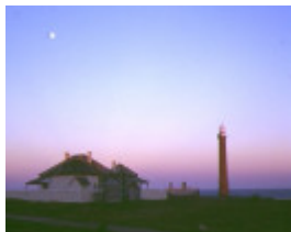
1 gabo island lightstation aug 99