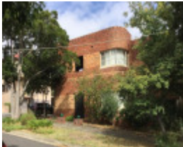
2 Denmark Hill Road.jpg