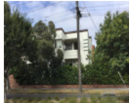
The corner of Havelock Road and Denmark Hill Road.jpg