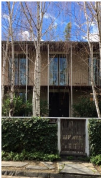
Brett House exterior.jpg