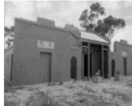
1 bendigo chinese temple finn street bendigo front