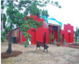
BENDIGO CHINESE TEMPLE SOHE 2008