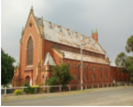
UNITING CHURCH AND SUNDAY SCHOOL SOHE 2008