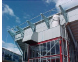
H1977 former Olympic pool