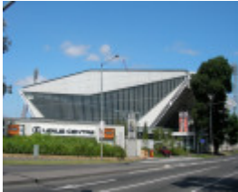
OLYMPIC SWIMMING STADIUM SOHE 2008