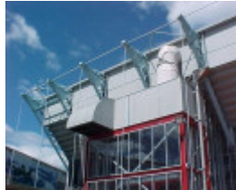
H1977 former Olympic pool