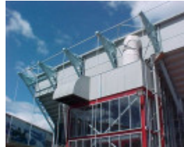
H1977 former Olympic pool