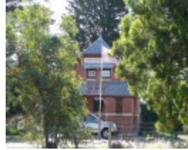
FORMER PRIMARY SCHOOL NO. 668 SOHE 2008