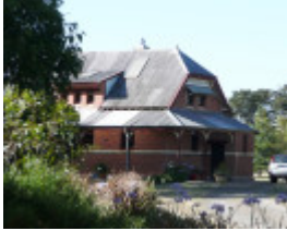
FORMER PRIMARY SCHOOL NO. 668 SOHE 2008