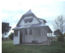
former primary school no668 cardigan side view entrance aug1984