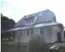
1 former primary school no688 cardigan front view aug1984