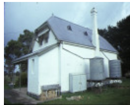
former primary school no668 cardigan rear view aug1984