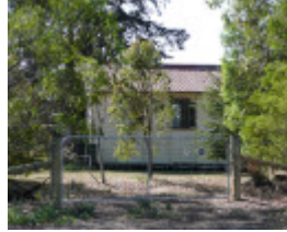
FORMER PRIMARY SCHOOL NO. 668 SOHE 2008