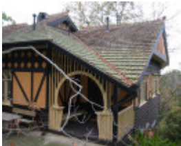
h02082 officer house eaglemont mz june2005 03