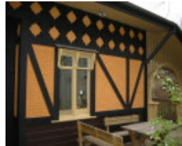
h02082 officer house eaglemont mz june2005 04