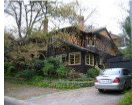
h02082 1 officer house eaglemont mz june2005 001