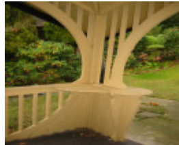
h02082 officer house eaglemont mz june2005 05