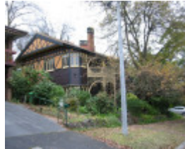
h02082 officer house eaglemont mz june2005 02