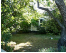
KEYHAM SOHE 2008