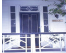
h01128 keyham pakington st and cnr aphrasia and somers newtown front door she project 2003