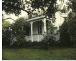
1 keyham pakington street newtown front view jul1995