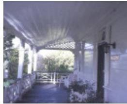
h01128 keyham pakington st and cnr aphrasia and somers newtown verandah she project 2003