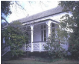
h01128 keyham pakington st and cnr aphrasia and somers newtown front verandah she project 2003