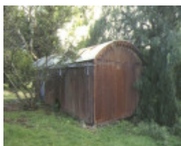
1 prefabricated iron cottage mt duneed road mt duneed front view jun1995