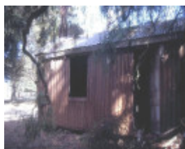
h01131 prefabricated iron cottage mt duneed rd mount duneed front left aspect she project 2003