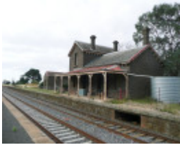
CARLSRUHE RAILWAY STATION SOHE 2008