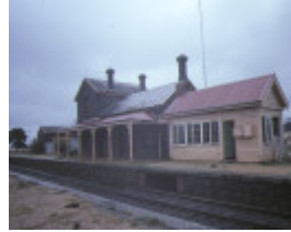
1 carlsruhe railway station trackside view sep1984