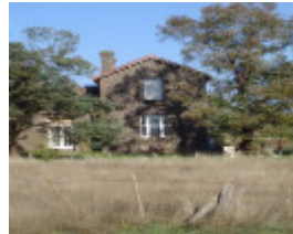
Carlsruhe Railway Station May 2006