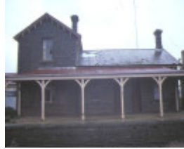
carlsruhe railway station platform view sep1984