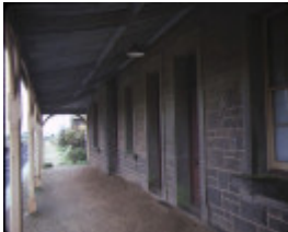
carlsruhe railway station verandah sep1984