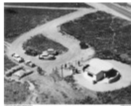
Historical Image LL