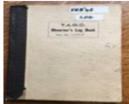
VAOC Registered Object