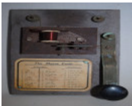
VAOC Registered Object