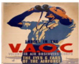
VAOC Poster (AWM)