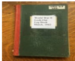
VAOC Registered Object