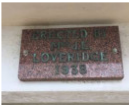
VAOC Registered Object