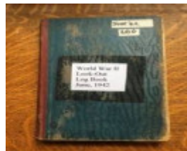
VAOC Registered Object