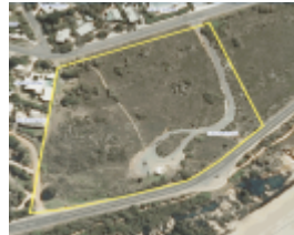
Aerial Photo 2020