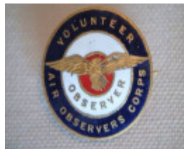
VAOC Registered Object