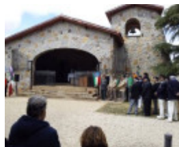
Italian Ossario Ceremony