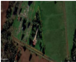
Aerial Photo of Registered Extent