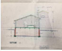
Italian Ossario - Historical Plan