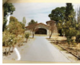
Italian Ossario - Historical Image