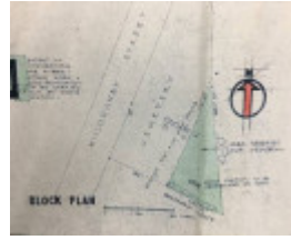
Italian Ossario - Historical Plan