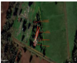
Aerial Photo of Features