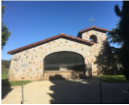
Italian Ossario 2020