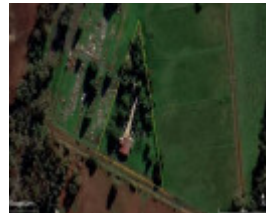
Aerial Photo of Registered Extent