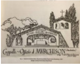
Italian Ossario - Historical Image