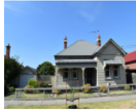
Federation era dwelling