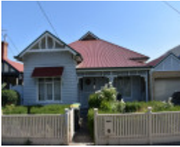
Federation era dwelling