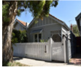
Interwar era dwelling