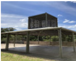
Gazebo Upper Level of Concrete Pavilion