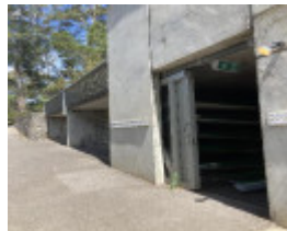
Lower Level Pavilion