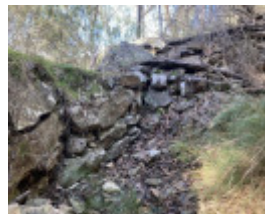
main trench overlooking road