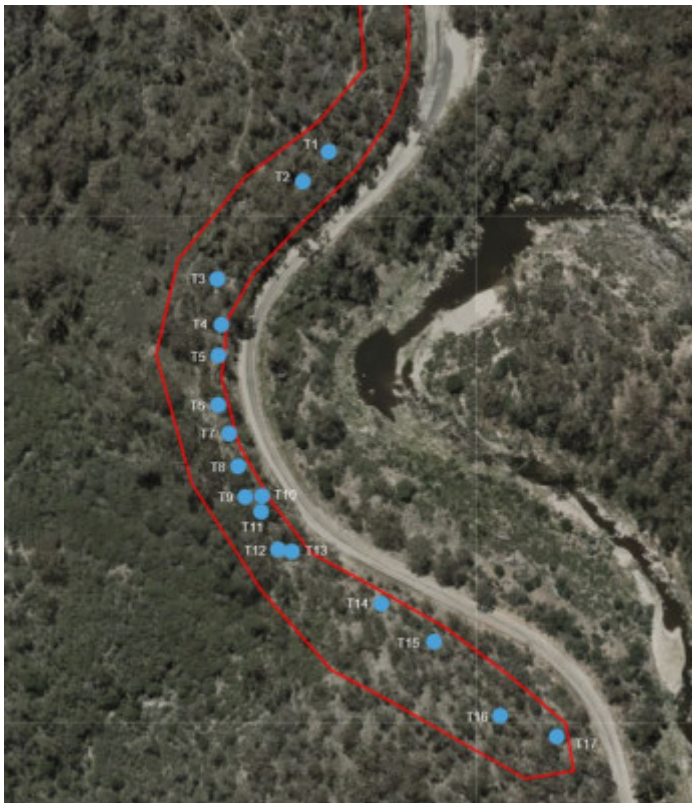
Location of the 17 known trenches