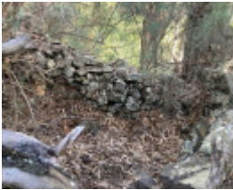
2023, East wall of Trench 7