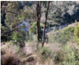
2023, Concealed view to the road from Trench 13.