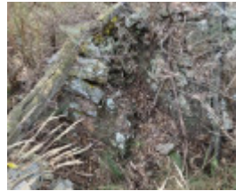
2023, North wall of Trench 9