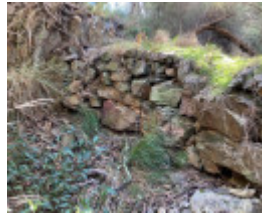
2023, north wall of Trench 13