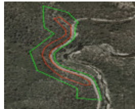
Aerial registration extent