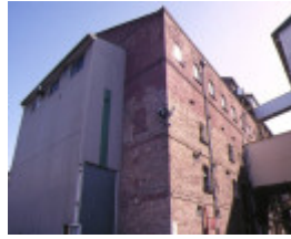
h01311 colonial sugar refinery whitehall street yarraville retail packing house