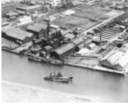
h01311 csr whitehall street yarraville december 1939