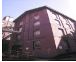
h01311 colonial sugar refinery whitehall street yarraville melting house