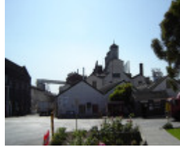
h01311 1 csr yarraville veiv from west 12 04 mz