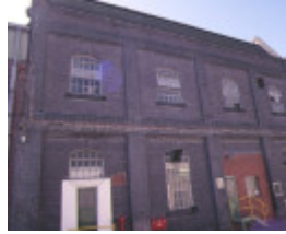
Colonial Sugar Refinery Whitehall Street Yarraville Store