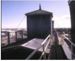
h01311 colonial sugar refinery whitehall street yarraville char tower