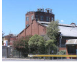
CSR COMPLEX SOHE 2008