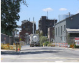
CSR COMPLEX SOHE 2008