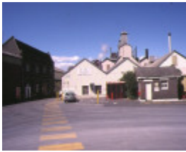
Colonial Sugar Refinery Whitehall Street Yarraville View from West