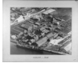
h01311 csr whitehall street yarraville august 1949