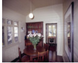
chadwick house the eyrie eaglemont breakfast room she project 2003