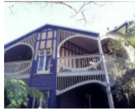
chadwick house the eyrie eaglemont south east verandah detail she project 2003