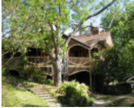
CHADWICK HOUSE SOHE 2008