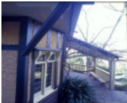
chadwick house the eyrie eaglemont south west verandah she project 2003