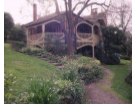
1 chadwick house eaglemont front view