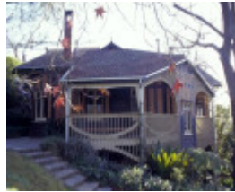
chadwick house the eyrie eaglemont south elevation she project 2003