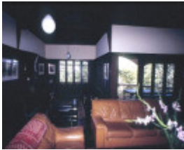
chadwick house the eyrie eaglemont sitting room she project 2003