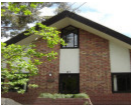
H2091 Lippincott House Glenard Dr Heidelberg Front Elevation 02 Nov2005