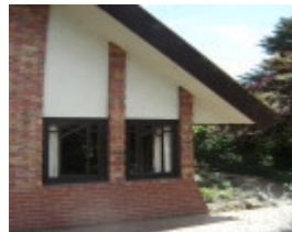
H2091 Lippincott House Glenard Dr Heidelberg Window Detail 02 Nov2005 mz