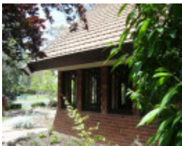
H2091 Lippincott House Glenard Dr Heidelberg Corner Window Detail Nov2005 mz