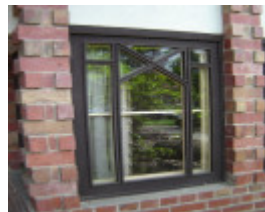
H2091 Lippincott House Glenard Dr Heidelberg Window Detail 01 Nov2005 mz