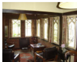
H2091 Lippincott House Glenard Dr Heidelberg Windows Sitting Room Nov2005 mz