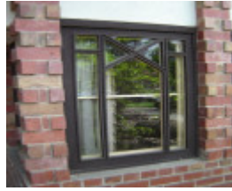
Lippincott House Glenard Dr Heidelberg Window Detail November 2005