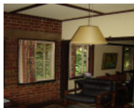
H2091 Lippincott House Glenard Dr Heidelberg Sitting Room Nov2005 mz