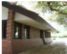
H2091 Lippincott House Glenard Dr Heidelberg Side Elevation Nov2005 mz