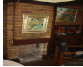
H2091 Lippincott House Glenard Dr Heidelberg fireplace Sitting Room Nov2005 mz