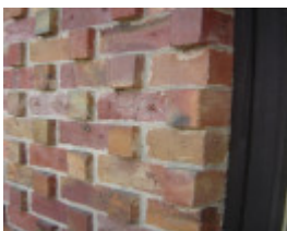
H2091 Lippincott House Glenard Dr Heidelberg Brick Detail Nov2005 mz