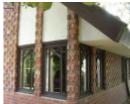
H2091 Lippincott House Glenard Dr Heidelberg Window Detail 04 Nov2005 mz