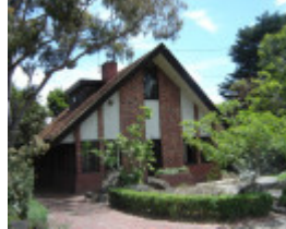
H2091 01 Lippincott House Glenard Dr Heidelberg Front Elevation 01 Nov2005 mz