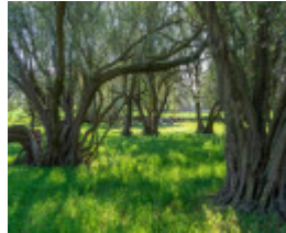
NominatedPhoto4976 897-olive 5