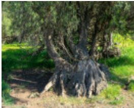
NominatedPhoto4973 873-olive 2