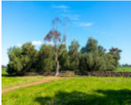
NominatedPhoto4971 11-olive 8