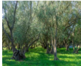
NominatedPhoto4972 898-olive 1