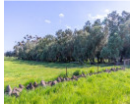
NominatedPhoto4974 236-olive 3