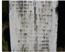
2022 headstone detail