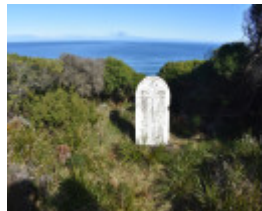
2022 headstone in context