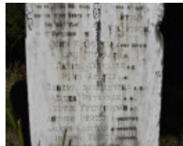
2022 headstone detail