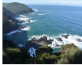
2022 land and sea scape near Wreck Beach