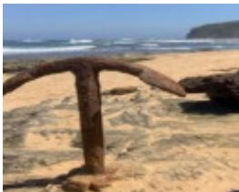
2023 Fiji anchor monument