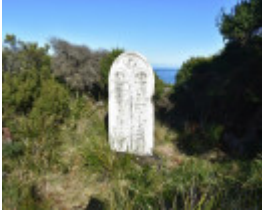
2021 gravesite and headstone