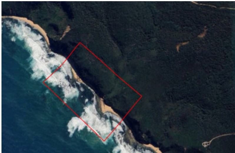
2023 Aerial diagram showing extent of registration