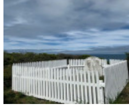
2023 gravesite and headstone