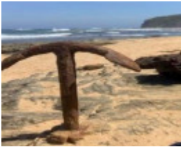
2023 Fiji anchor monument - photograph courtesy of Parks Victoria