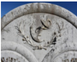
2022 headstone detail 2