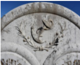
2022 headstone detail 2