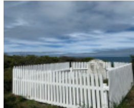
2023 gravesite and headstone