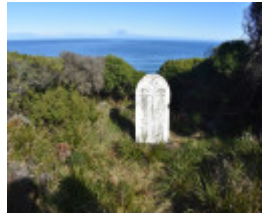
2022 headstone in context