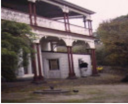
H1206 glenfine homestead