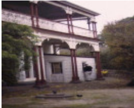
H1206 glenfine homestead