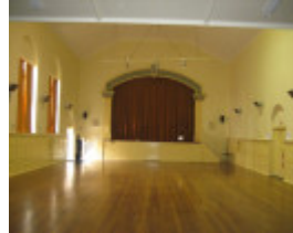
St Ignatius Church Richmond Sept 2007 School Hall Interior