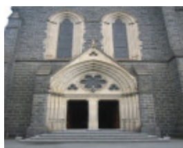
St Ignatius Church Richmond 3 May 2007 Front - East- Entrance