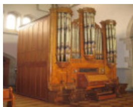
St Ignatius Church Richmond 3 May 2007 Fincham Organ