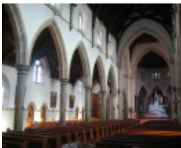
St Ignatius Church Richmond 3 May 2007 Nave 02