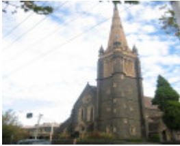
St Ignatius Church Richmond 3 May 2007 Spire and Front Elevation