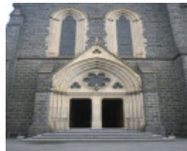
St Ignatius Church Richmond 3 May 2007 Front - East- Entrance