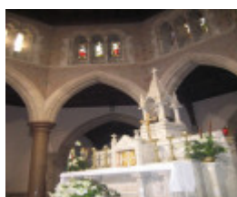
St Ignatius Church Richmond 3 May 2007 Sanctuary 01