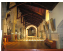
St Ignatius Church Richmond 3 May 2007 North Aisle