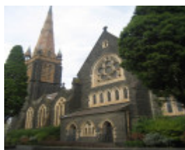
St Ignatius Church Richmond 3 May 2007 Spire and North Elevation