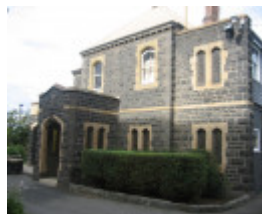
St Ignatius Church Richmond 3 May 2007 Presbytery 01