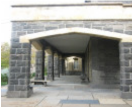
St Ignatius Church Richmond 3 May 2007 Presbytery 02