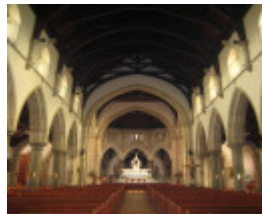
St Ignatius Church Richmond 3 May 2007 Nave 01