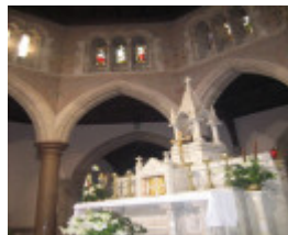
St Ignatius Church Richmond 3 May 2007 Sanctuary 01