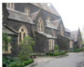
St Ignatius Church Richmond 3 May 2007 South Elevation