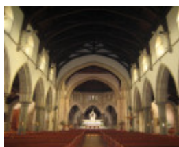
St Ignatius Church Richmond 3 May 2007 Nave 01