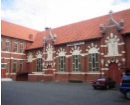
St Ignatius Church Richmond 3 May 2007 School Hall