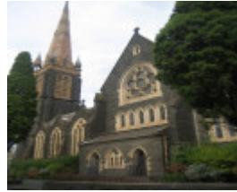
St Ignatius Church Richmond 3 May 2007 Spire and North Elevation