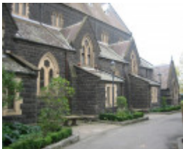
St Ignatius Church Richmond 3 May 2007 South Elevation