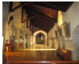
St Ignatius Church Richmond 3 May 2007 North Aisle