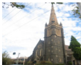
St Ignatius Church Richmond 3 May 2007 Spire and Front Elevation