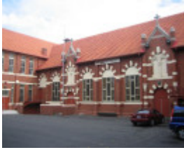
St Ignatius Church Richmond 3 May 2007 School Hall