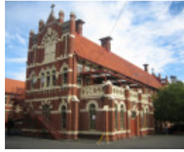
St Ignatius Church Richmond 3 May 2007 School North Wing