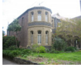
St Ignatius Church Richmond 3 May 2007 Presbytery 03