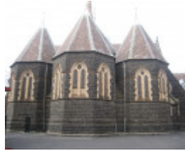
St Ignatius Church Richmond 3 May 2007 Western Elevation