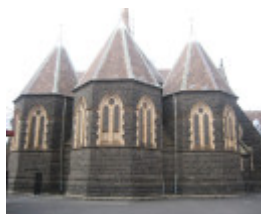
St Ignatius Church Richmond 3 May 2007 Western Elevation