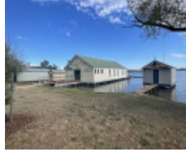
Boathouses - Lake Wendouree