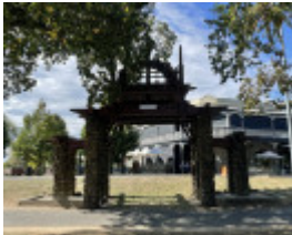
George Tonner Memorial Pagode