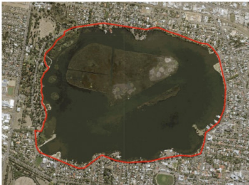
Extent of registration - Aerial view