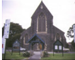
1 holy trinity church vicarage & hall nelson place williamstown church front view may1998