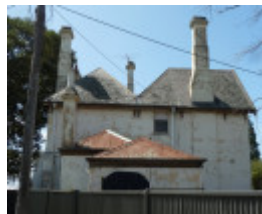
H1734 HOLY TRINITY CHURCH, VICRAGE AND HALL LHA 2015 6.JPG