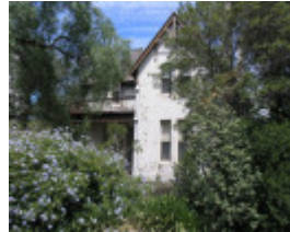
HOLY TRINITY CHURCH, VICARAGE AND HALL SOHE 2008