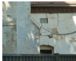
H1734 HOLY TRINITY CHURCH, VICRAGE AND HALL LHA 2015 5.JPG