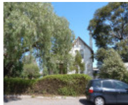
H1734 HOLY TRINITY CHURCH, VICRAGE AND HALL LHA 2015 3.JPG