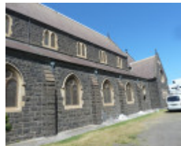
H1734 HOLY TRINITY CHURCH, VICRAGE AND HALL LHA 2015 2.JPG