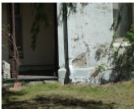
H1734 HOLY TRINITY CHURCH, VICRAGE AND HALL LHA 2015 4.JPG