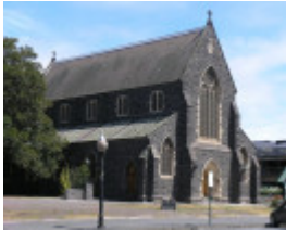
Holy Trinity Church, Vicarage and Hall SOHE 2008