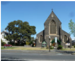
H1734 HOLY TRINITY CHURCH, VICRAGE AND HALL LHA 2015 1.JPG