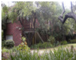
CAIRO FLATS SOHE 2008