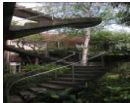
1 cairo flats nicholson street fitzroy exterior staircase oct1993