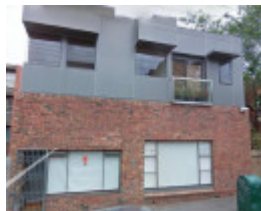
14 HANOVER STREET.jpg