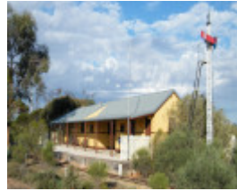
2022, Former Irymple Railway Station Building, platform side (signal not from Irymple)