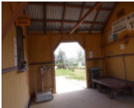
2022, Interior of lobby with ticket windows and remnant walls