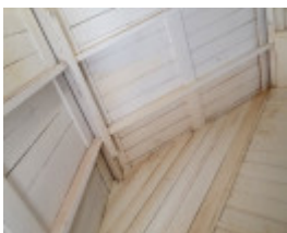
2020, interior of roof