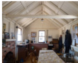
2022, Ticket window and counter and fireplace inside the office at Irymple