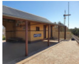
2020, Lobby and doors to the General and Ladies' waiting rooms