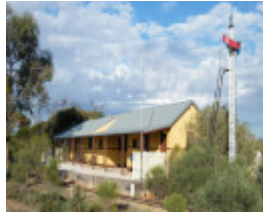
2022, Former Irymple Railway Station Building, platform side (signal not from Irymple)