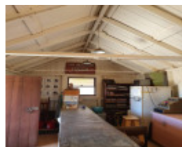
Interior of office with parcels counter at Red Cliffs