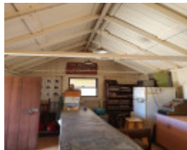
Interior of office with parcels counter at Red Cliffs