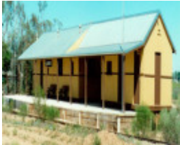
August 2022 Former Irymple Railway Station Building