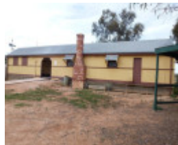
2022, Chimney side of building and edge of modern picnic shelter