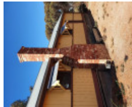
2020, Chimney and window sunshades