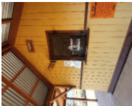
2020, ticket window in lobby