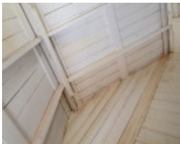
2020, interior of roof