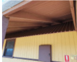
2022, Type A ventilated roof on the Former Irymple Railway Station building showing the battened timber inner roof and ventilator