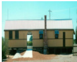
2022, Station building at Red Cliffs after 2001 restoration