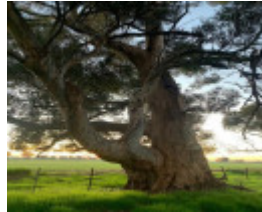
NominatedPhoto6368 358- Tree 2 750x750