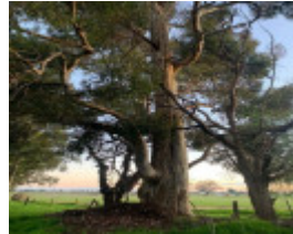
NominatedPhoto6369 932- Tree 3 750x750