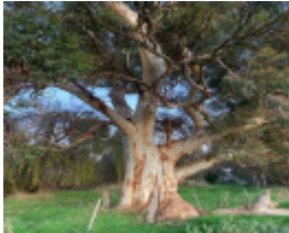
NominatedPhoto6370 894- Tree 4 750x750