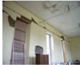
FORMER ST ANDREWS PRESBYTERIAN CHURCH AND MANSE SOHE 2008