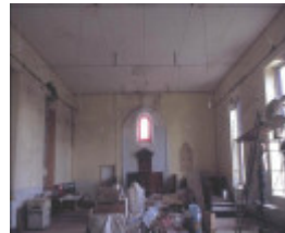
h00850 former st andrews presbyterian church and manse william st port fairy church interior she project 2003