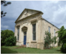
FORMER ST ANDREWS PRESBYTERIAN CHURCH AND MANSE SOHE 2008