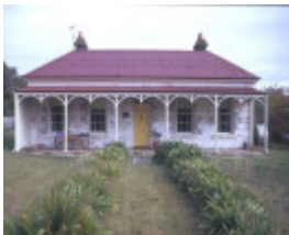
h00850 former st andrews presbyterian church and manse william st port fairy front of manse she project 2003