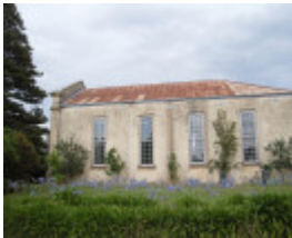
FORMER ST ANDREWS PRESBYTERIAN CHURCH AND MANSE SOHE 2008