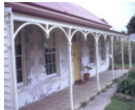
h00850 former st andrews presbyterian church and manse william st port fairy manse front verandah she project 2003