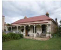
FORMER ST ANDREWS PRESBYTERIAN CHURCH AND MANSE SOHE 2008