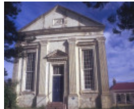
h00850 1 former st andrews presbyterian church and manse william st port fairy front facade she project 2003