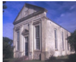
h00850 former st andrews presbyterian church and manse william st port fairy overall view she project 2003