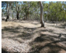
HARD HILL MINING SITE SOHE 2008