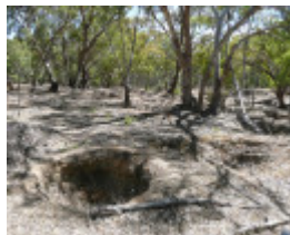
HARD HILL MINING SITE SOHE 2008