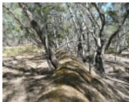
HARD HILL MINING SITE SOHE 2008