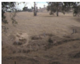
1 hard hill mining site garden gully road stawell landscape mar1990