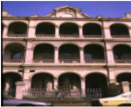
drummond terrace drummond street carlton front elevation sep1990