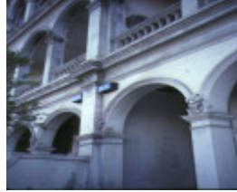
drummond terrace drummond street carlton detail of colonaded verandah may1990