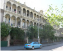
DRUMMOND TERRACE SOHE 2008