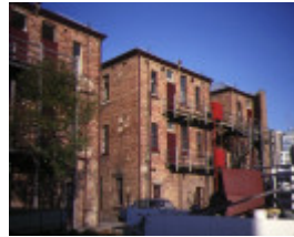
drummond terrace drummond street carlton rear view may1990