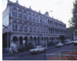
1 drummond terrace drummond street carlton front view of row may1985