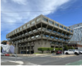
2023 - north and east elevations