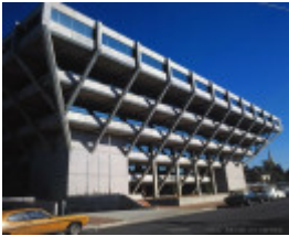
1979 State Government Offices viewed from Little Malop Street