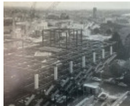
August 1977 the State Government Offices under construction