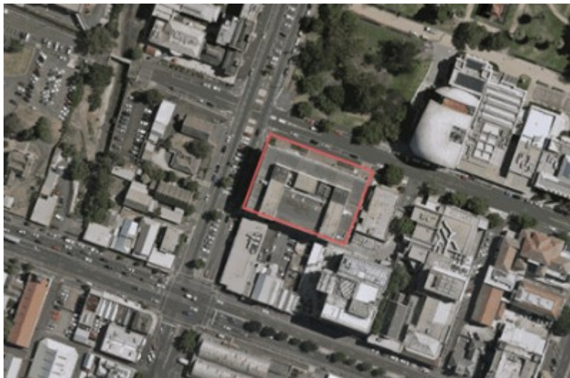
2023 aerial diagram extent of registration