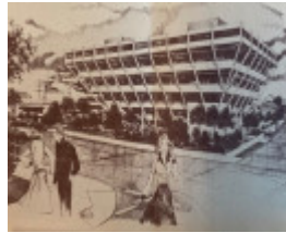
Undated artist's impression of the building