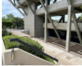
2023 The building is stepped down from Fenwick Street creating a small plaza below