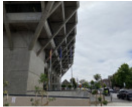
2023 - plaza on Little Malop Street