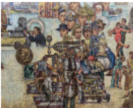
2023 - mural detail