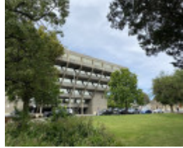
2023 - viewed from Johnstone Park