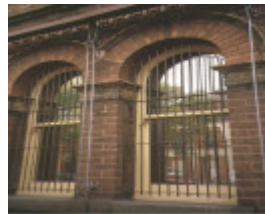
police station drummond street carlton detail of windows