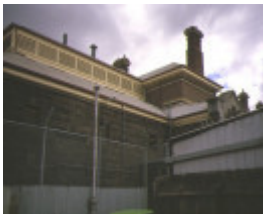
police station drummond street carlton lock up & watchhouse 1997