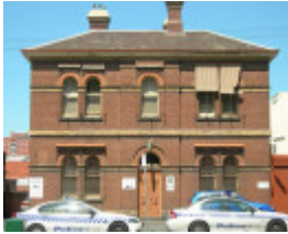
POLICE STATION SOHE 2008