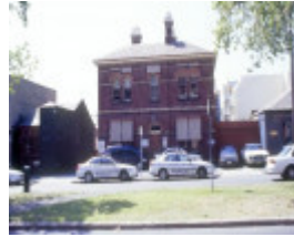
h01543 police station drummond street carlton front