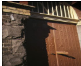
police station drummond street carlton detail of door