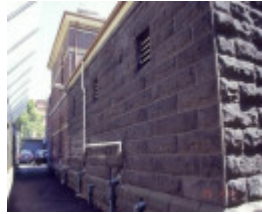
h01543 police station drummond street carlton side building b