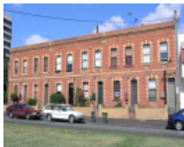
CAMBRIDGE TERRACE SOHE 2008