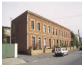
1 cambridge terrace drummond street carlton north front view dec1998