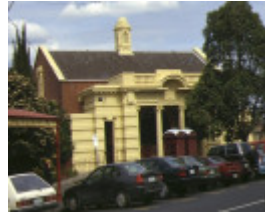
FORMER SOUTH MELBOURNE POST OFFICE SOHE 2008