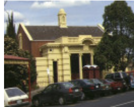
FORMER SOUTH MELBOURNE POST OFFICE SOHE 2008