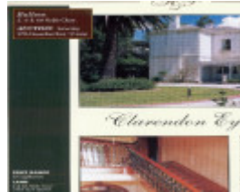
22364 Sales Brochure for Clarendon Eyre - 6 Robb Close, Bulleen