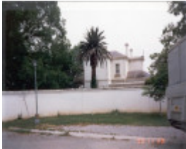
22364 Clarendon Eyre - 6 Robb Close, Bulleen (House)