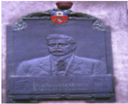
trades hall lygon street carlton cast iron frieze