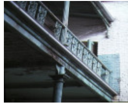
trades hall lygon street carlton balcony