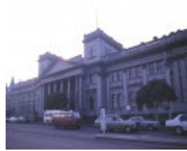
1 trades hall lygon street carlton front view jul1987