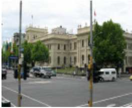
TRADES HALL SOHE 2008