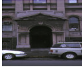
trades hall lygon street carlton detail of entrance