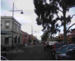
Ferguson St & Douglas Pde Com. Prec., Hobsons Bay Heritage Study 2006