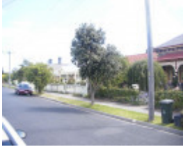
Hannan's Farm Heritage Precinct, Hobsons Bay Heritage Study 2006