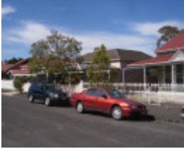
James Street Heritage Precinct WILLIAMSTOWN, Hobsons Bay Heritage Study 2006